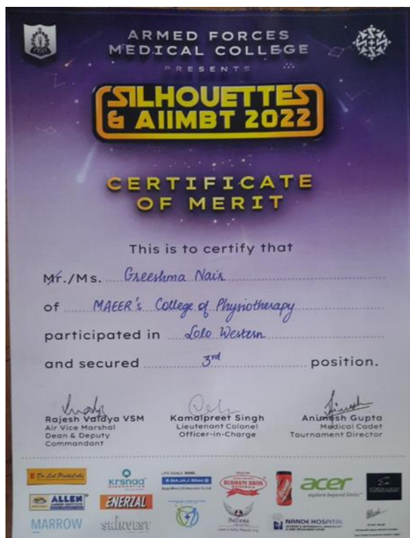
Greeshma Nair won 3 rd position in Solo Western dance at Silhouettes.